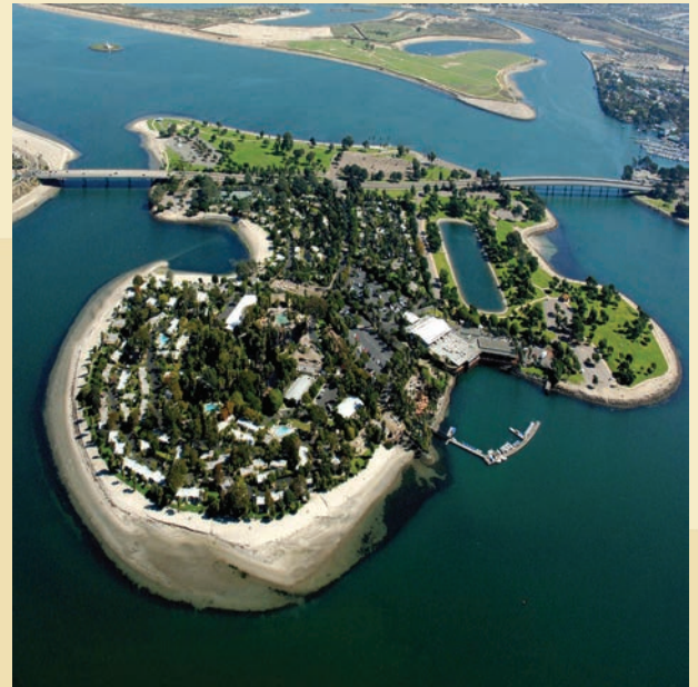
Paradise Point Hotel & Spa